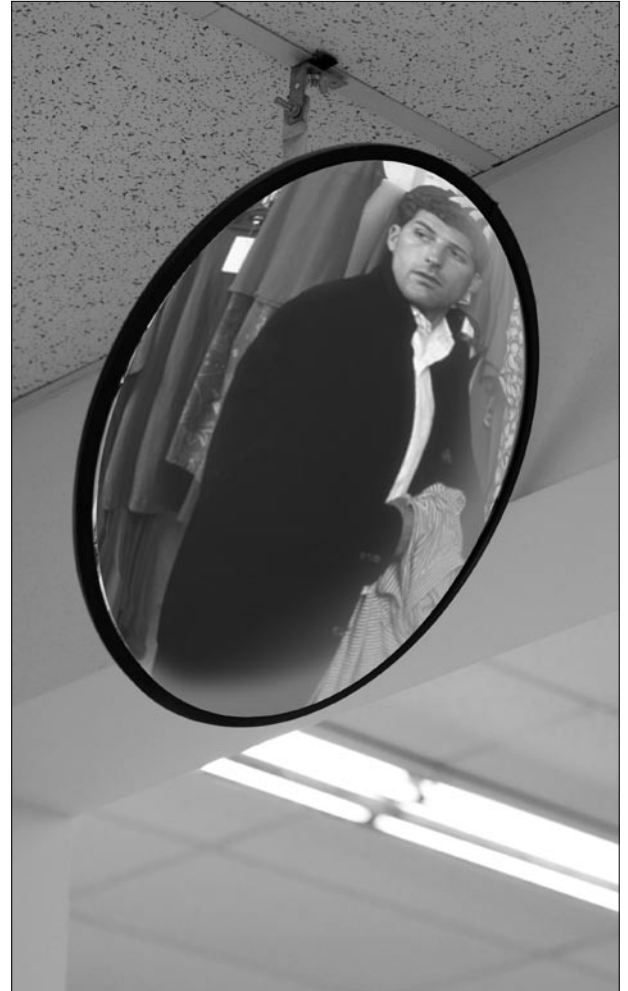
Overhead mirrors allow workers to see other parts of the store from the cash register.