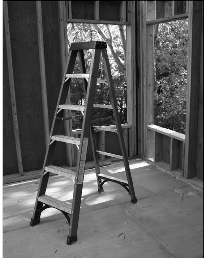
Even a stepladder can be a serious potential hazard for workers who are working alone or in an isolated location.

Once you've identified hazards, the next step is to assess the risks associated with them. A risk assessment will help you prioritize which hazards should be dealt with immediately and which ones can be dealt with later. When assessing risks, try to determine how likely an incident is and how serious it would be.