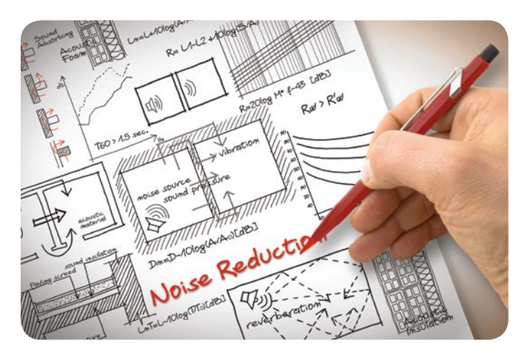
Noise control and hearing conservation programs must include engineered noise control.

As an employer, you must implement a noise control and hearing conservation program if your workers are exposed to noise levels greater than 85 dBA (over an eight-hour workshift) or 140 dBC peak sound level. Your program must include specific elements, such as noise measurement, hearing tests, hearing protection, and engineered noise controls. For a complete list of requirements, see section 7.5 of the Occupational Health and Safety Regulation.