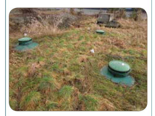
Hatches on septic tanks

Poultry and egg farms in rural areas aren't part of municipal sanitary collection systems. These operations must have stand-alone sewage treatment facilities, including collection and processing chambers.