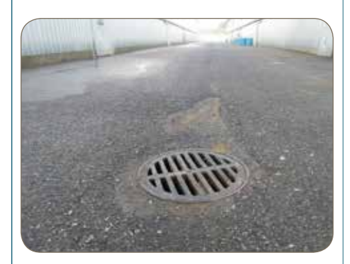
Stormwater manhole between poultry barns

Sumps are below-ground chambers used to collect drainage from surface and subsurface sources. When the trap in the outflow pipe overflows, collected water is transferred to another location through the outflow pipe. Sumps act as separation chambers before discharging to stormwater drainage. Stormwater manholes serve the same function but may not include the separation capability.