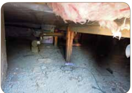
Exterior entrance and crawl space

Crawl spaces or cellars may contain a toxic or low-oxygen atmosphere if there's not enough natural ventilation. Oxygen in the space may be depleted if moisture and metal are present. The oxygen is used up as the metal rusts. Other toxic gases may also accumulate, depending on the use of the building above the crawl space or material being stored in the crawl space.