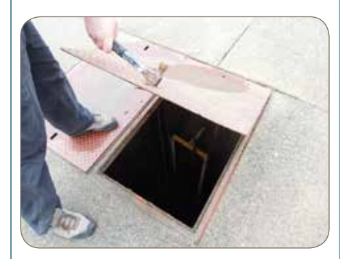
Lift station hatchway