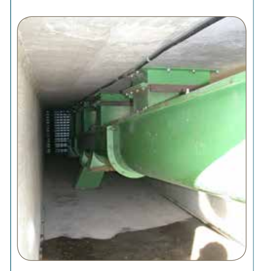
Conveyor in a tunnel