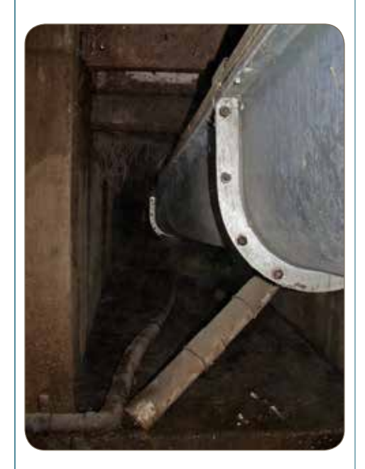
Conveyor in a tunnel

Augers and conveyors transport solid material either from a container to a vehicle (for example, grain from a bin to a transport truck) or from place to place (for example, from production to a storage facility). The enclosure containing the auger or conveyor is considered a confined space.