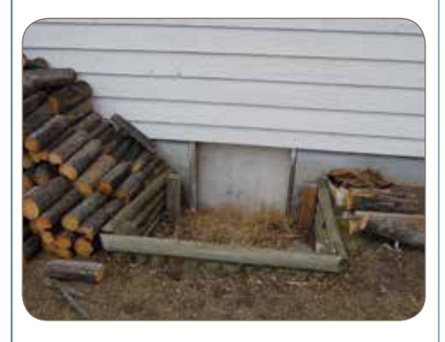
Exterior crawl space entrance