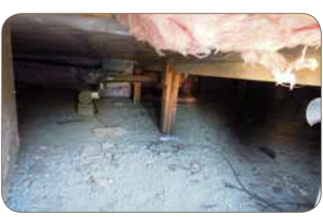
Exterior entrance and crawl space

Crawl spaces or cellars may contain a toxic or low-oxygen atmosphere if there's not enough natural ventilation. Oxygen in the space may be depleted if moisture and metal are present. The oxygen is used up as the metal rusts. Other toxic gases may also accumulate, depending on the use of the building above the crawl space or material being stored in the crawl space.