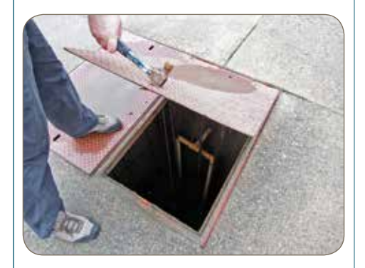
Lift station hatchway