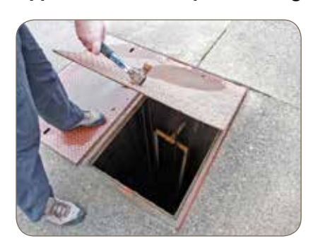
Lift station hatchway