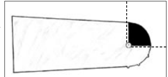
Make sure to avoid contact in the kickback zone (shown in black).

Contact in this zone makes the chain bunch up and try to climb out of the cutting track. This often happens when the saw tip makes contact with something beyond the cutting area, such as a tree branch, a log, or planks.