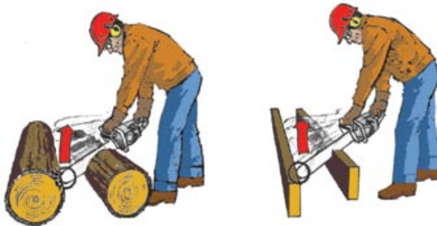
The examples above show how kickback can occur.

Take extra care when making pocket cuts. Start the cut with the underside of the chain tip, then work the saw down and back to avoid contact with the kickback zone. Consider the use of a sabre (reciprocating) saw to make pocket cuts.