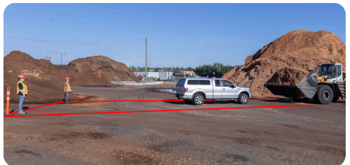
The red line shows the operator's blind spot. The operator can't see anything in that area, including the pickup truck and two people. View our blind spot video .