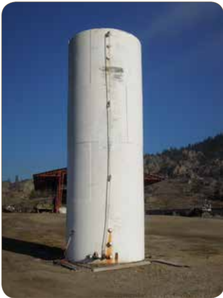
Fertilizer solution tank

Fuel and products such as liquid fertilizer solution are stored in tanks for use on demand.