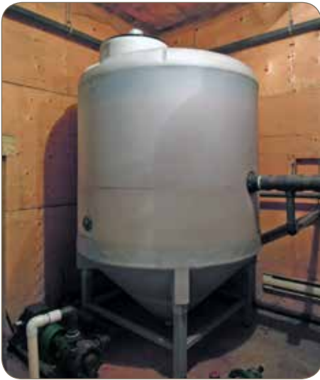
Water storage tank

Ranches, animal farms, and feedlots have storage tanks that hold potable water.