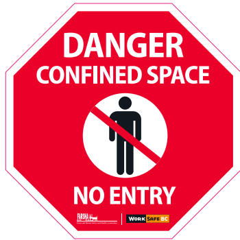
Confined space warning sign