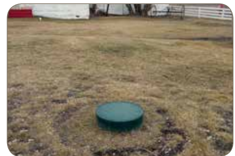
Septic tank hatch