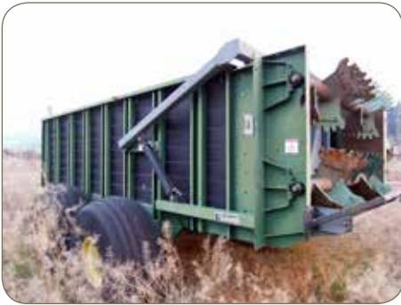
Solid manure spreader

Also, low oxygen conditions may occur if the tank has been empty for some time. Interior surfaces in these structures are also likely very slippery, which could lead to entrapment. Mixers and spreaders contain moving mechanical parts. Workers may be injured or killed if they fall into the operating machinery or if mechanical equipment is not locked out.