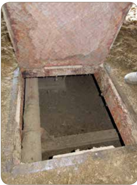
Scale pit hatchway

Scales are used for weighing animals and feed. A scale pit is a chamber located under the movable part of the scale. Access to the pit is from hatches on the top or side. These pits are confined spaces.