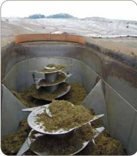
Mechanical equipment in a feed mixer