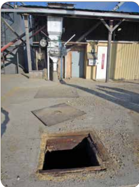
Auger tunnel hatchway

Augers and conveyors transport solid material either from a container to a vehicle (for example, feed from a bin to a transport truck) or from place to place (for example, from production to a storage facility). The enclosure containing the auger or conveyor is considered a confined space.