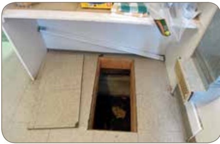
Interior crawl space entrance

Crawl spaces or cellars may contain a toxic or low-oxygen atmosphere if there's not enough natural ventilation. Oxygen in the space may be depleted if moisture and metal are present. The oxygen is used up as the metal rusts. Other toxic gases may also accumulate, depending on the use of the building above the crawl space or material being stored in the crawl space.