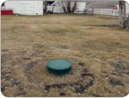
Septic tank hatch

Ranches, animal farms, and feedlots in rural areas aren't part of municipal sanitary collection systems. These operations must have stand-alone sewage treatment facilities, including septic tanks and processing chambers.