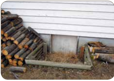
Exterior crawl space entrance