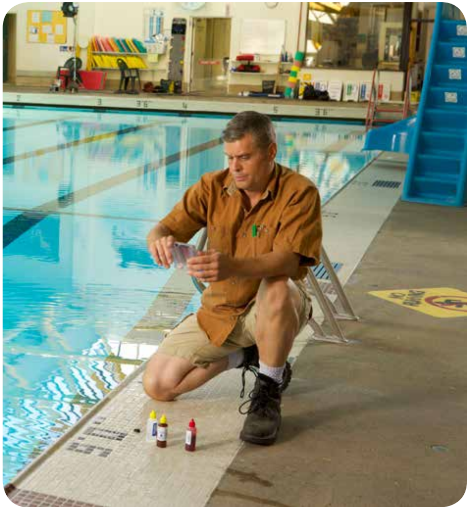
Checking pool water chemistry

Ideal pH differs from pool to pool and in every community, and is influenced by factors such as source water chemistry. Pool operators generally keep hot tubs at the lower end of the acceptable pH range for better disinfection, as chlorine works better at a lower pH. The main pool basin is frequently kept in the middle of the range.