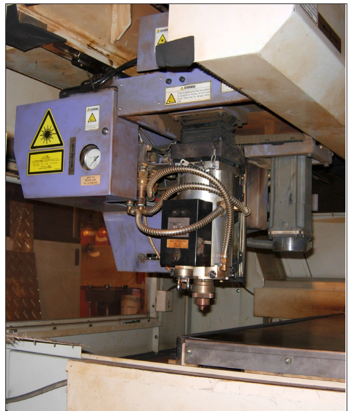
Industrial Laser – Beam Emitter