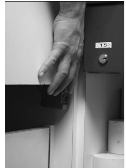
Employees can use a panic button behind the counter to summon help in an emergency.