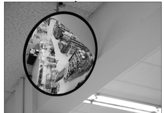
An overhead mirror can let employees see all the aisles in the store.

Evaluate the use of violence prevention controls in your business — inspect your workplace using the Safety and Security Checklist in Appendix F. Contact your local community police officer for advice on robbery and theft prevention.