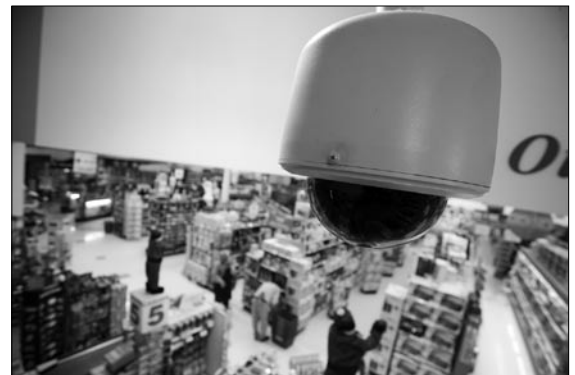
An overhead security camera records what's going on in the store and helps deter shoplifters and robbers.