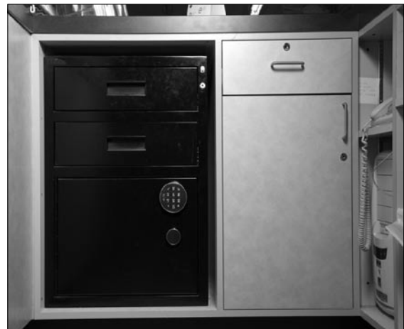
A safe with a time lock is useful for storing cash and other valuables.